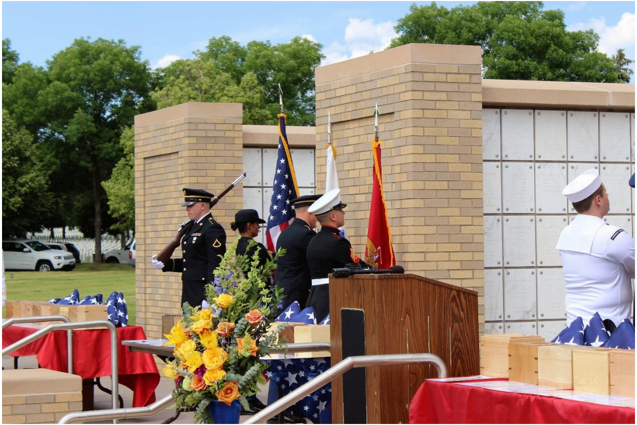
Posting the Colors