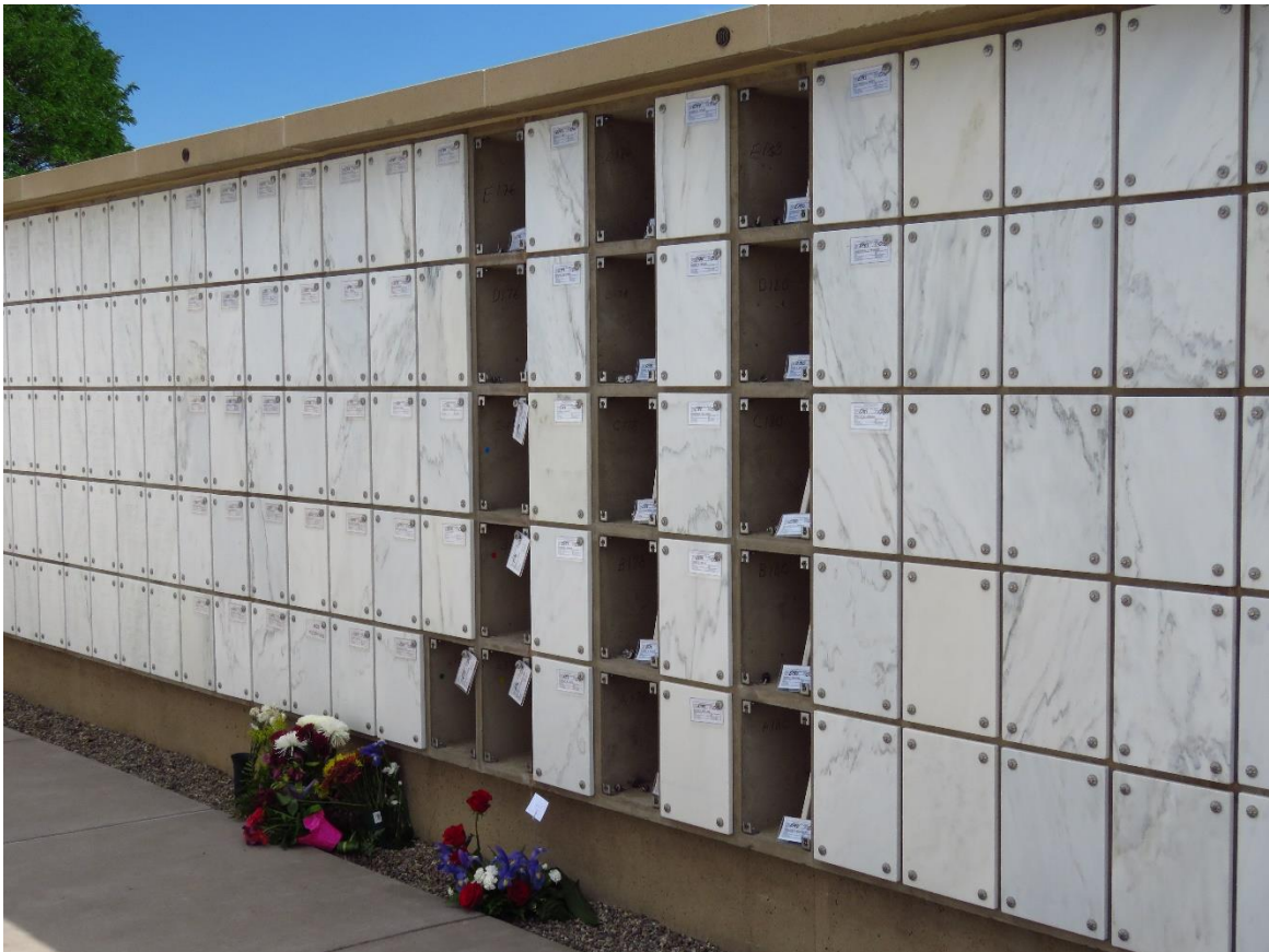
Columbarium Niches Open to Receive Urns