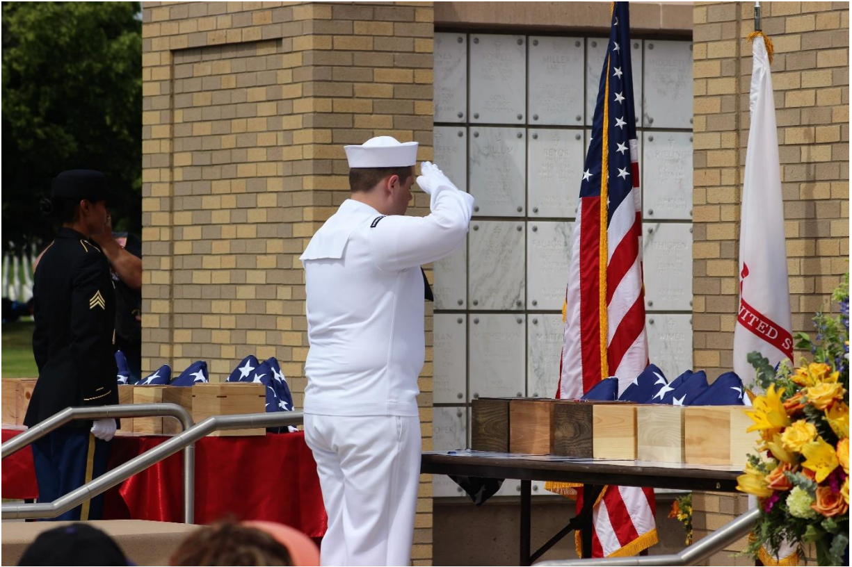
Roll Call Progresses to Center Table