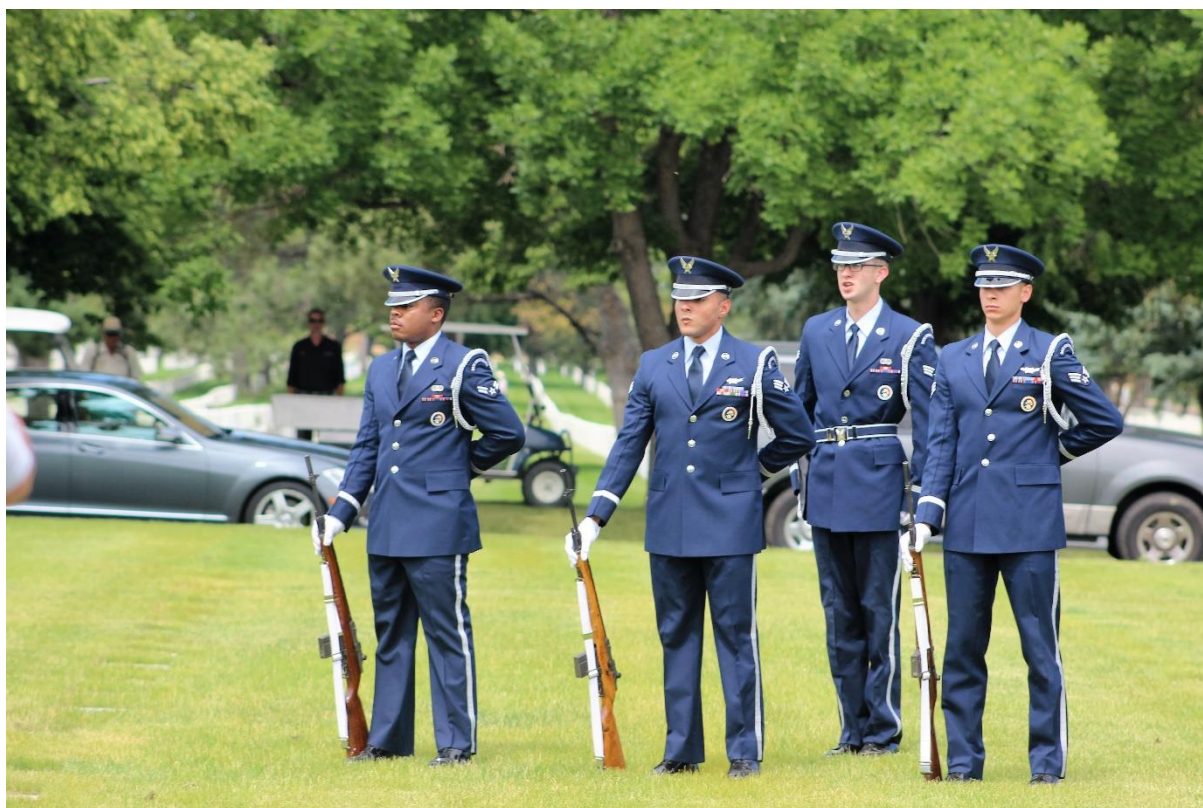
Firing Party Forms Up for Rifle Salute