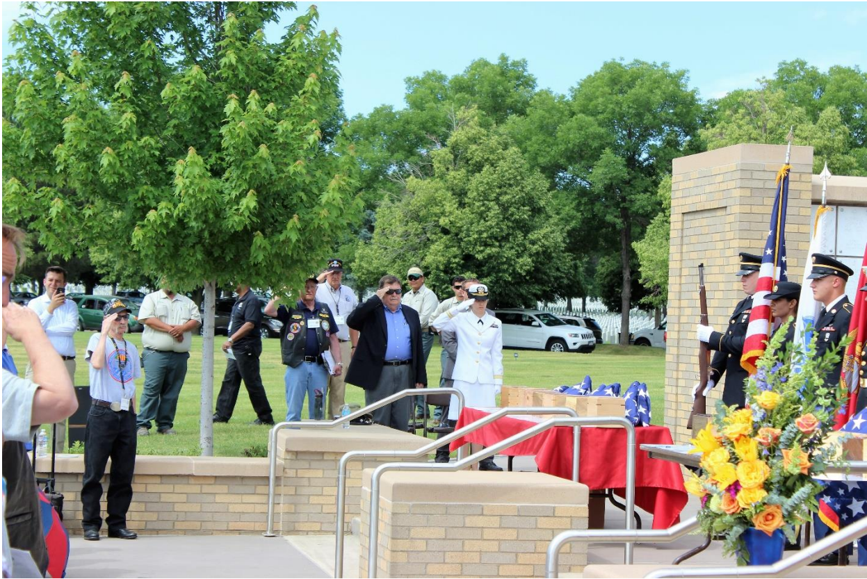
Kate Smith Sings the National Anthem