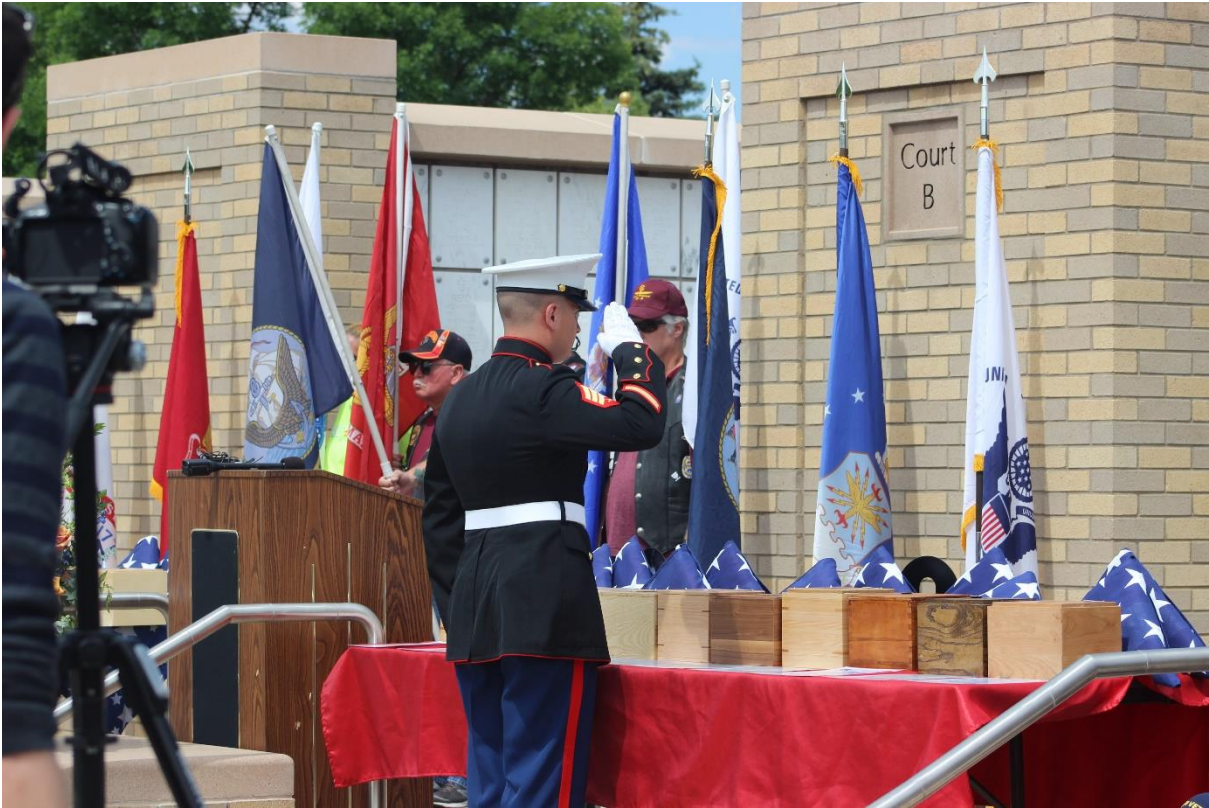
Navy Standard is Dipped for Navy Veteran