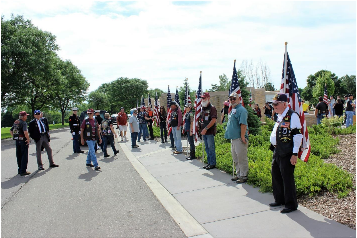
Patriot Guard Riders in Position