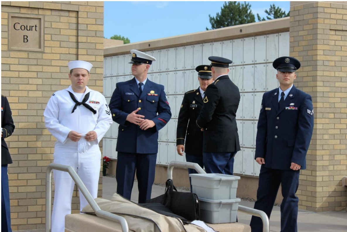
Colorado Color Guard