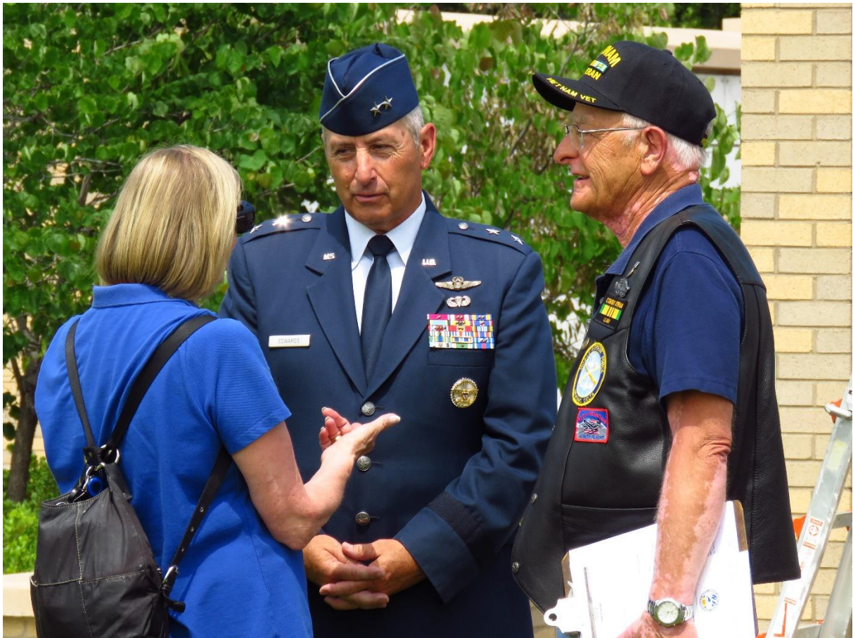
Debriefing the General