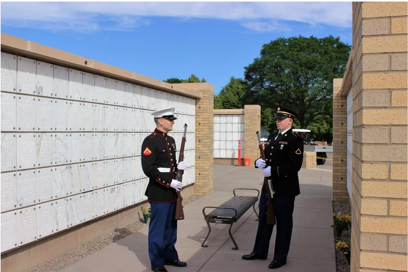
Flag Guards at the Ready