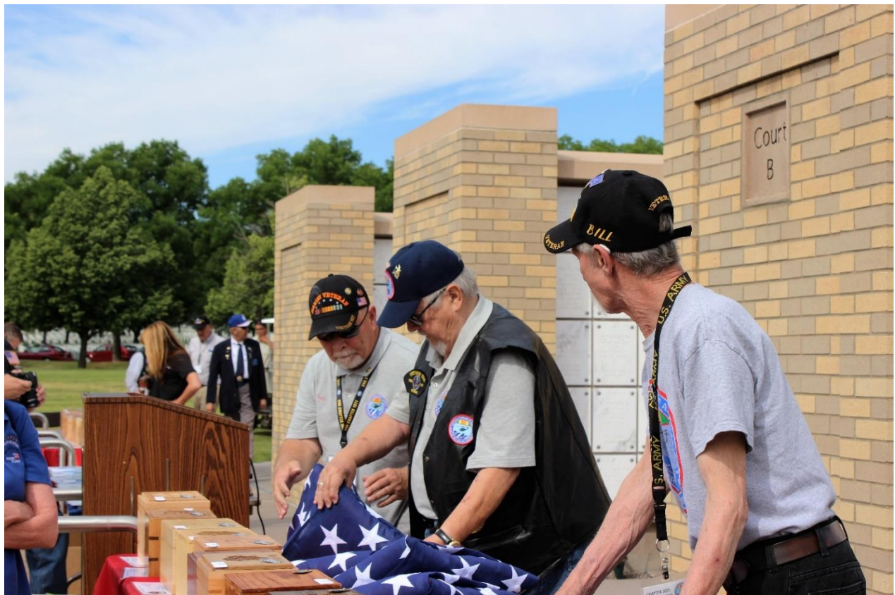
Setting Up the Tables [11]