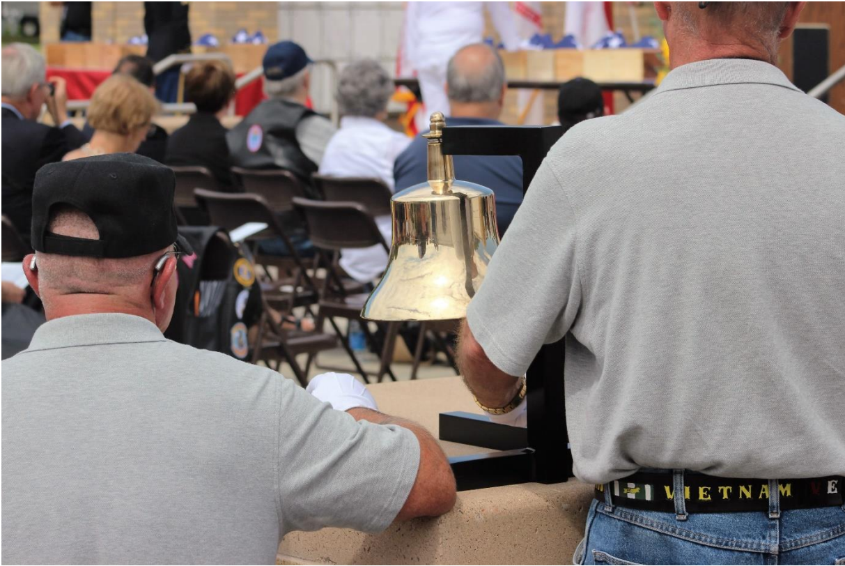
Bell is Rung Once at Each “Present” Response