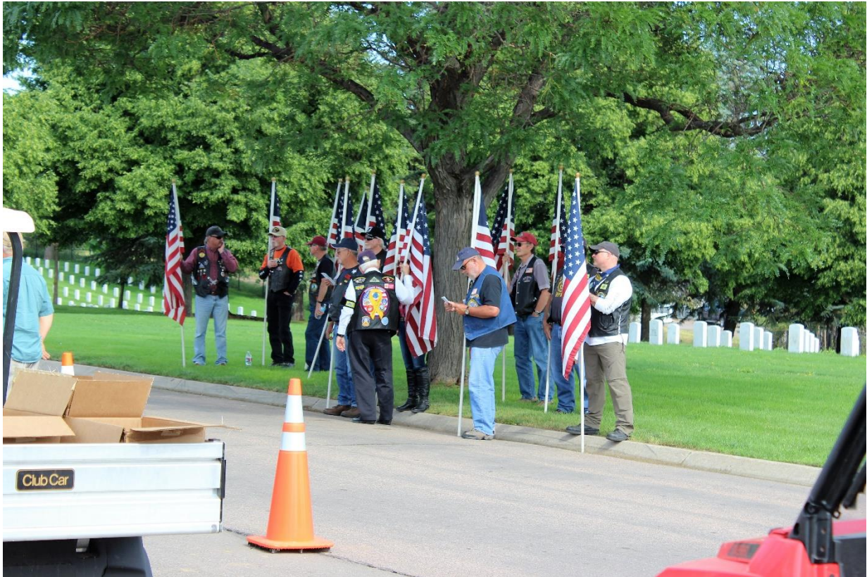
Colorado Patriot Guard Riders Forming Up