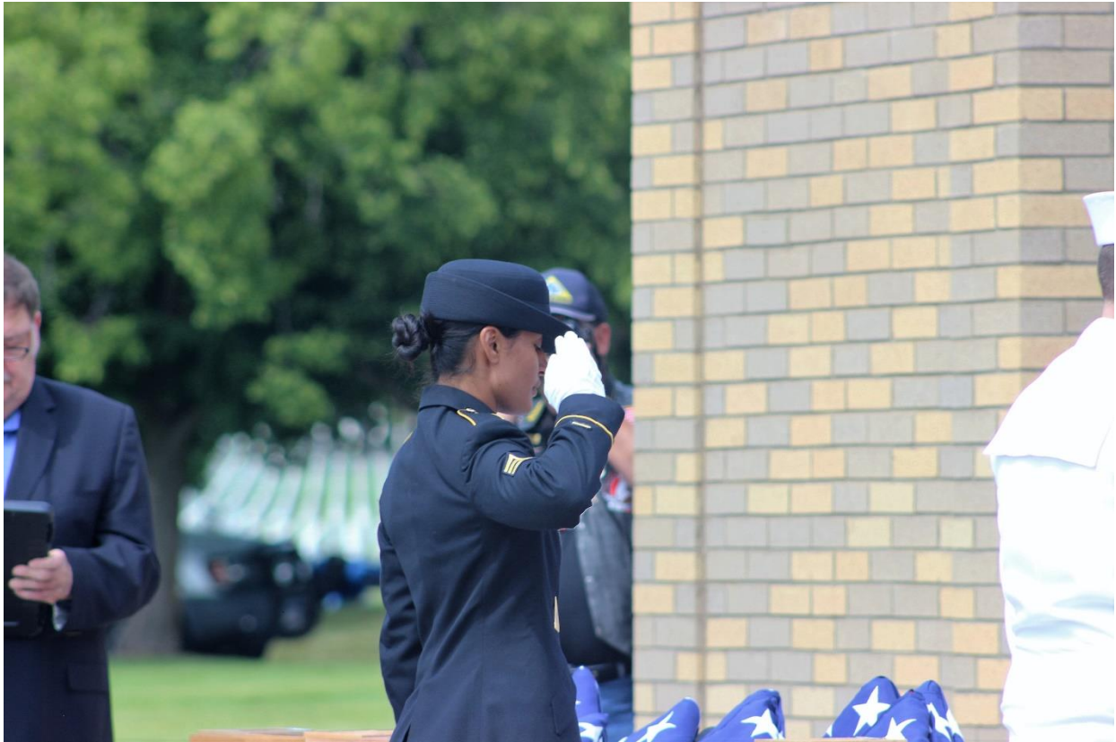
Honors Detail Recognizes Name