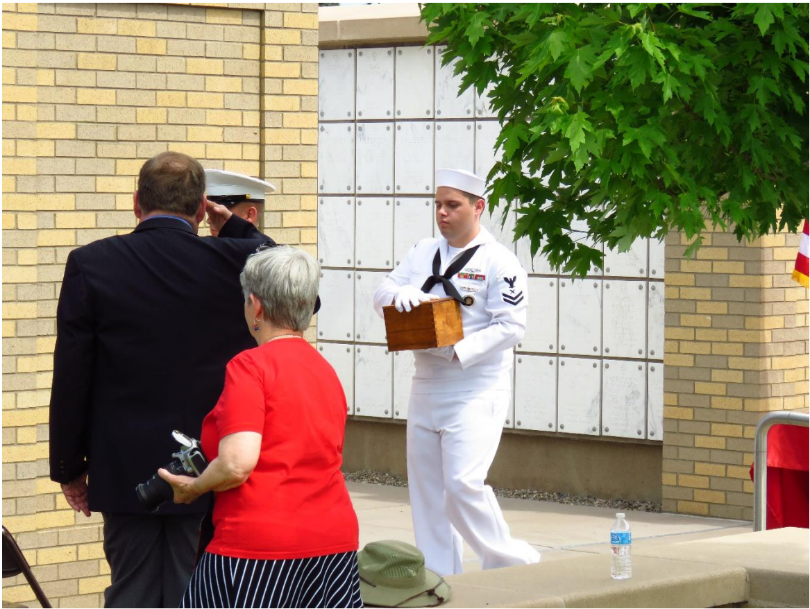
Urns Move for Placement