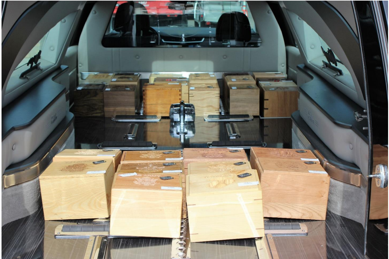
Urns in Hearse