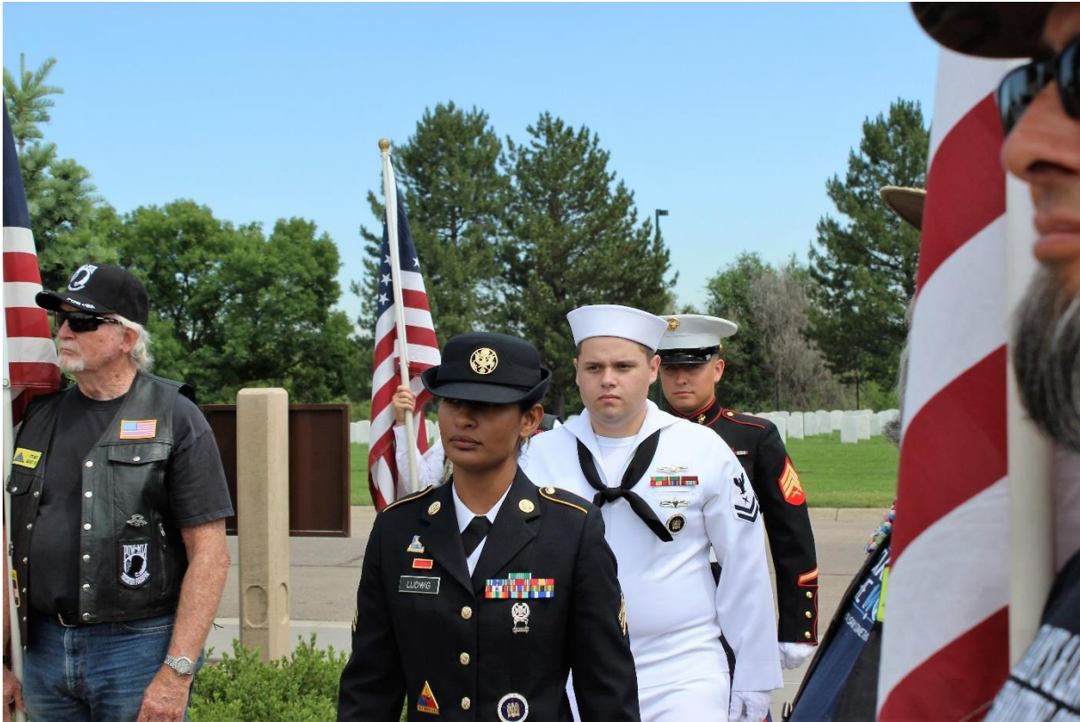
Honor Guard Returns for Final Roll Call