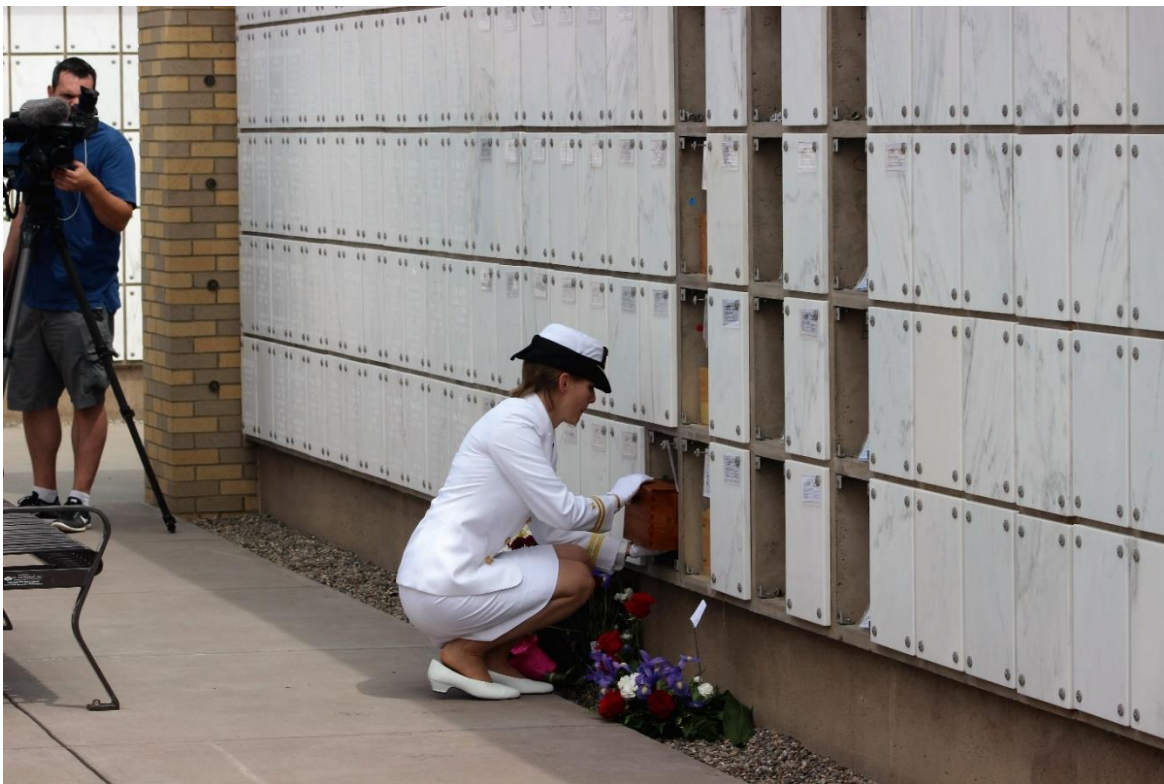
Last Urn is Placed in Columbarium