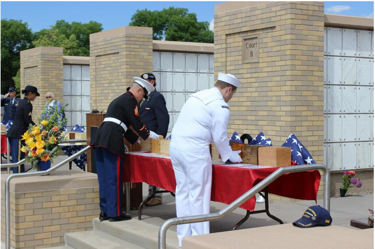
All Urns Carefully Aligned