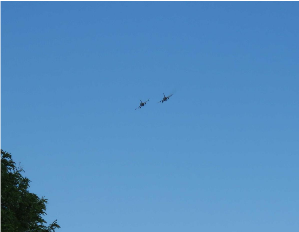
Flyover Departs on Heading 315