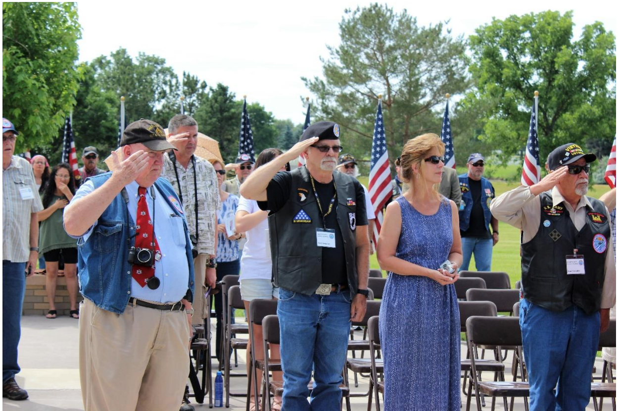
Respect for the National Anthem