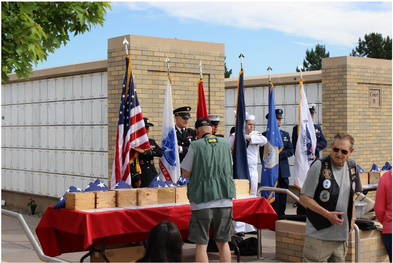
Color Guard Practicing Walk-Through