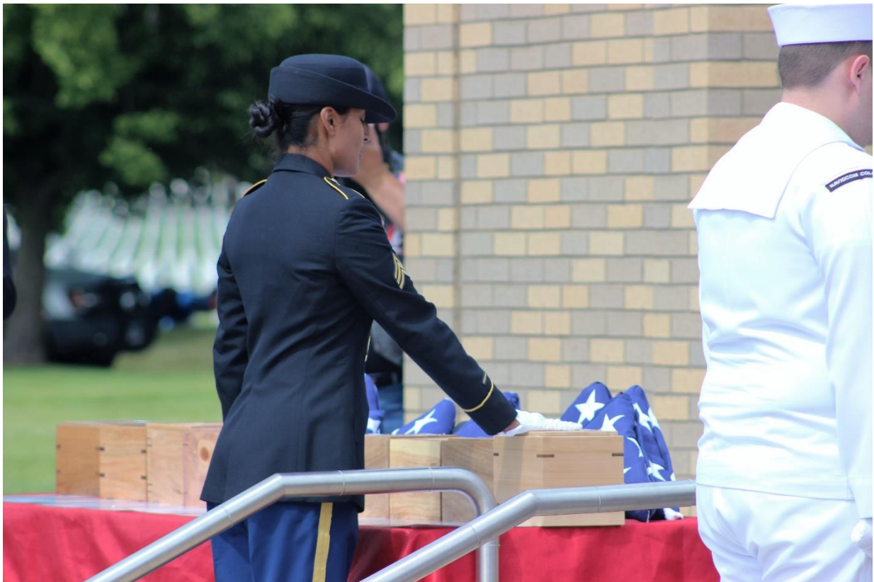
Honor Guard Acknowledges Veteran is Present