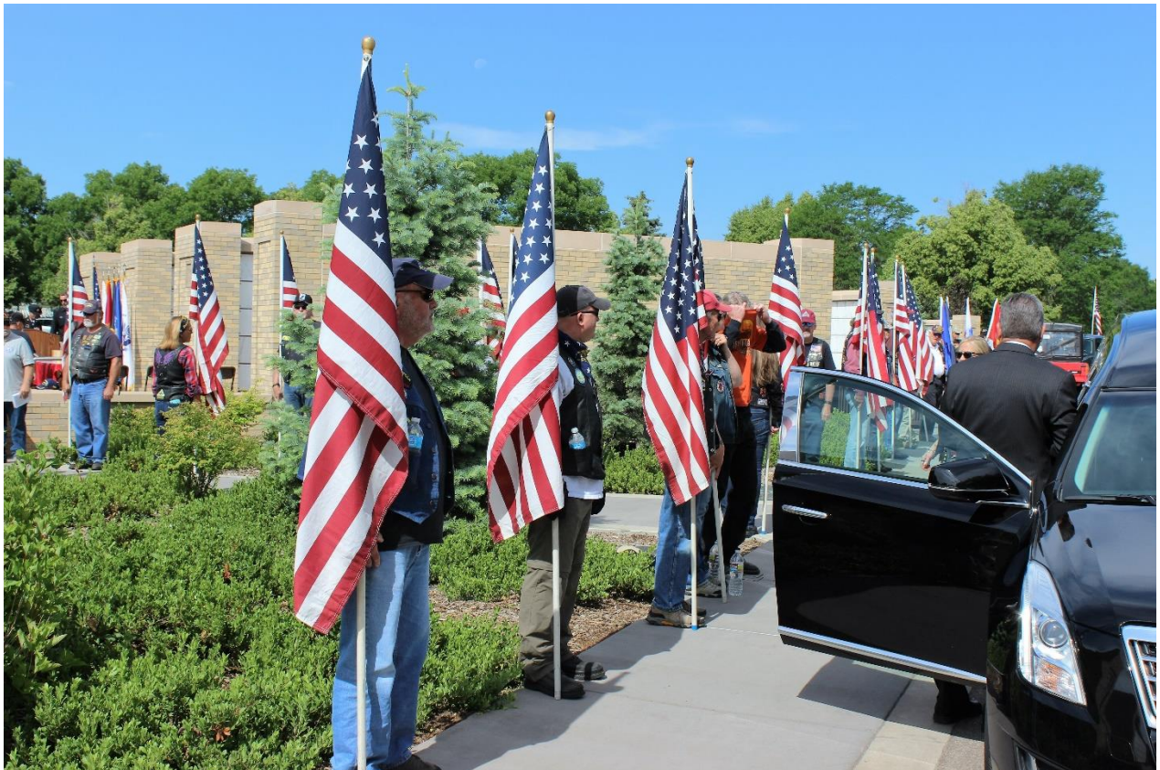
Ready to Start