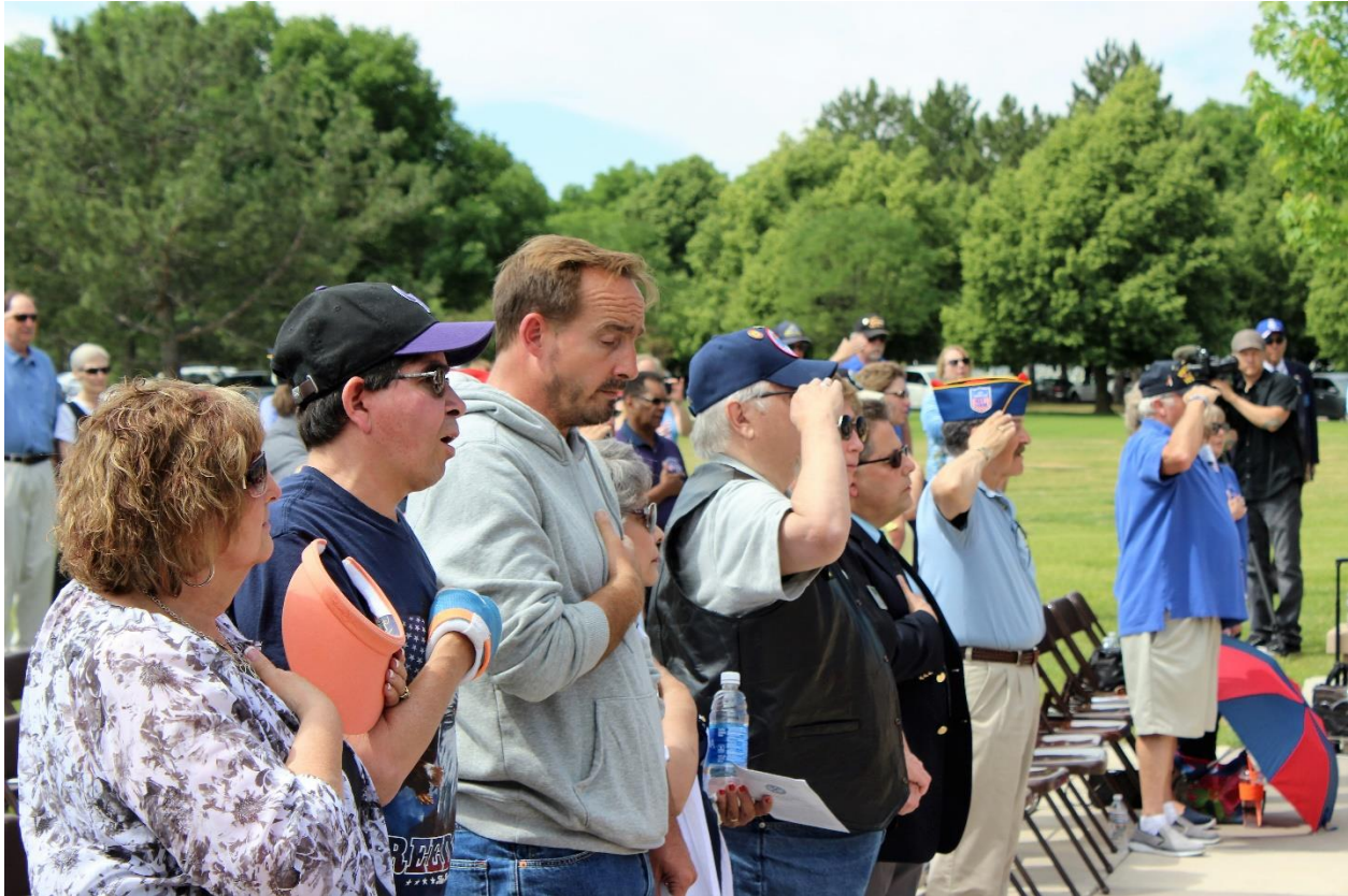
Respect for the National Anthem