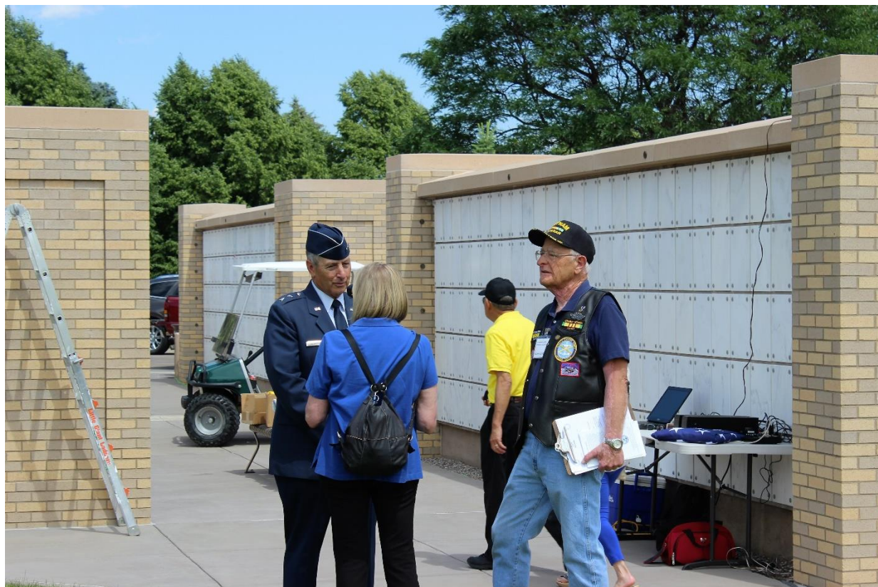
Shutting Down the Systems