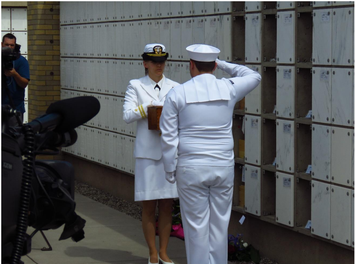
Navy Honor Guard Renders Final Respects