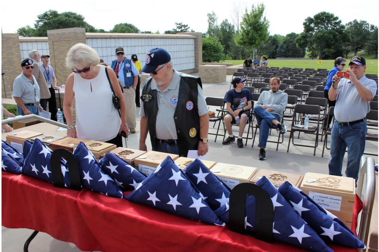
Almost Ready to Start