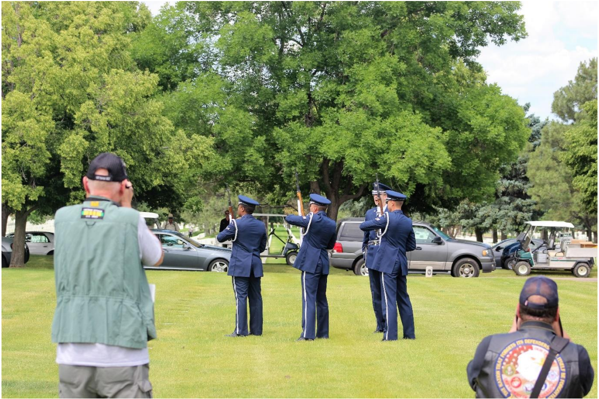
Firing Party Fires Three Volley Salute