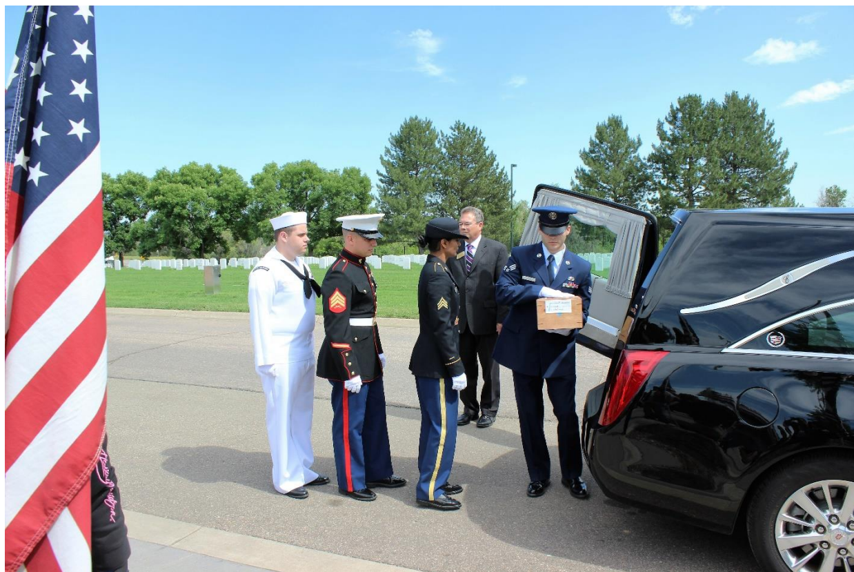
Branch Representative Urns Picked Up