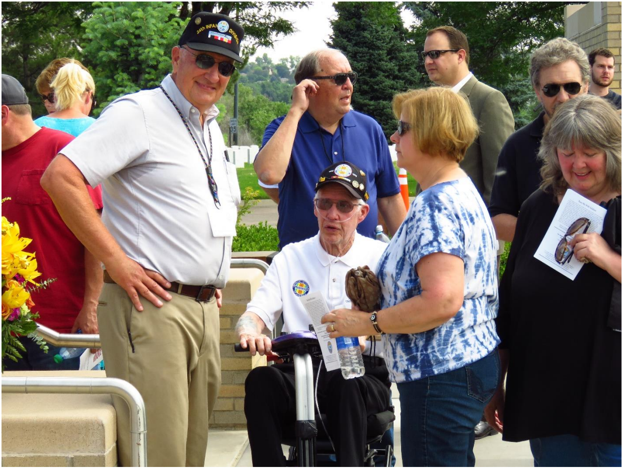
Lots of Pleased People After Ceremony Concludes