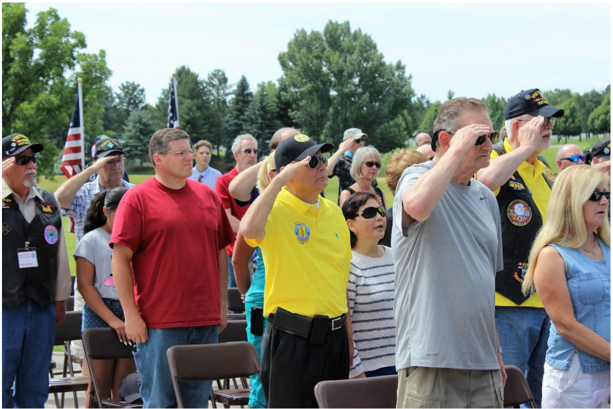
Respect for the National Anthem