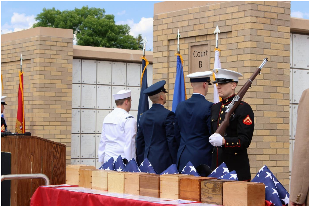
Posting the Colors