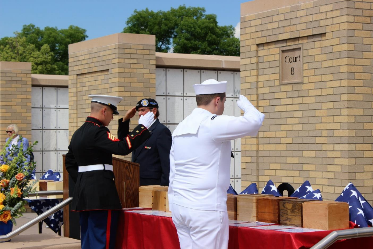
Honor Guard Retired