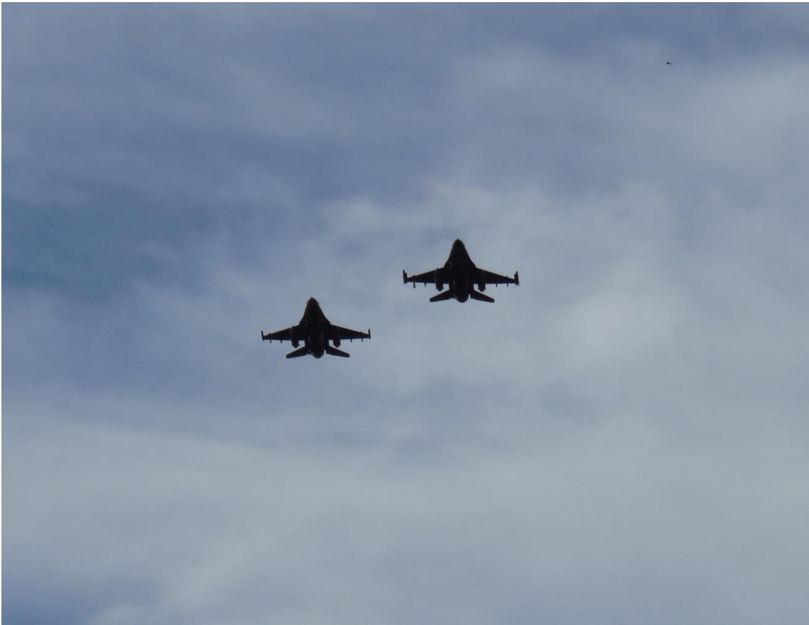
Two F-16's Approach to Honor Ceremony