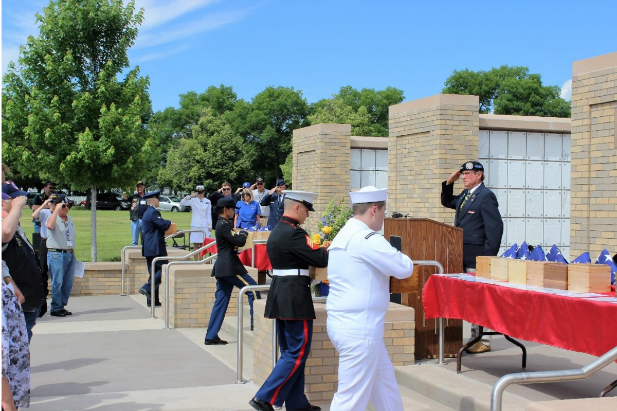
Branch Representative Urns Join the Others