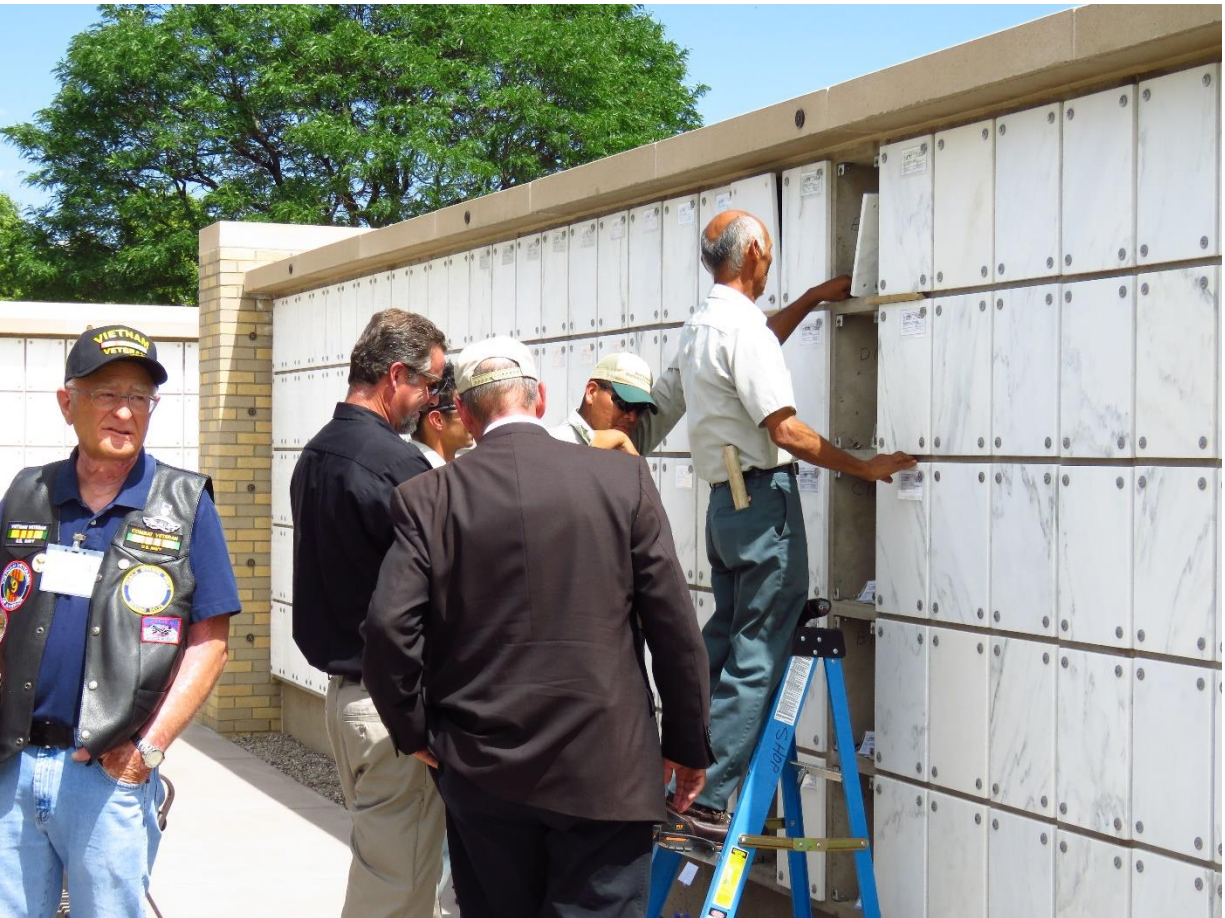
Placing the Remaining Urns