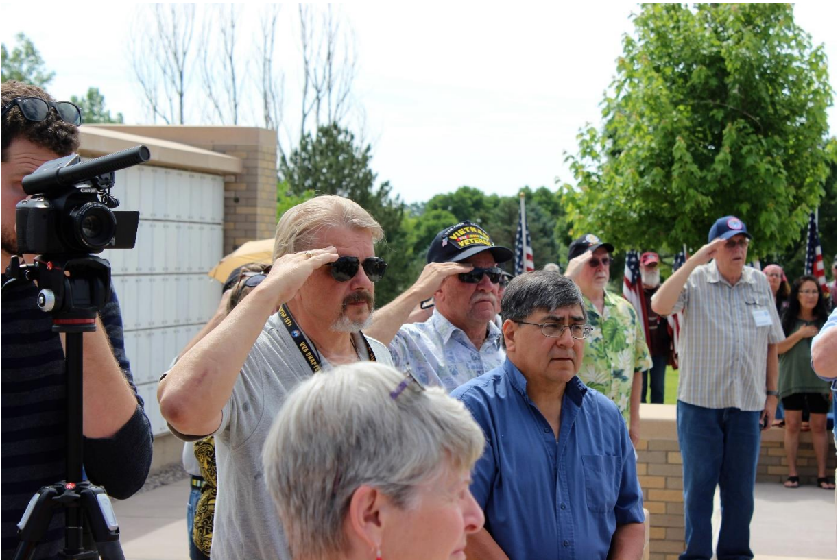
Respect for the National Anthem