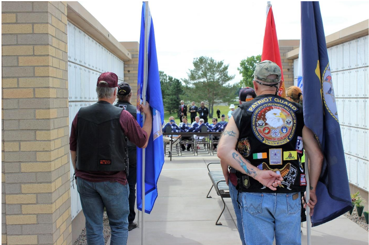
Patriot Guard Branch Flag Detail Forms Up