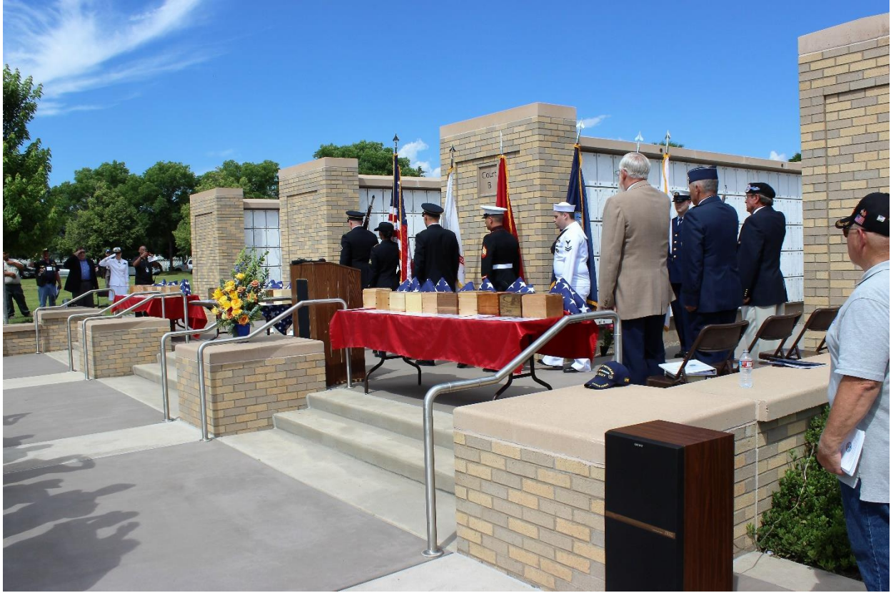
Color Guard Enters