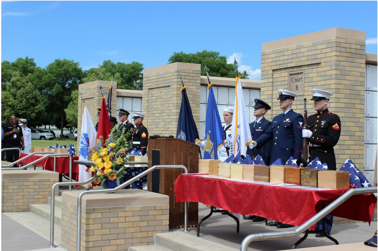
Pledge of Allegiance