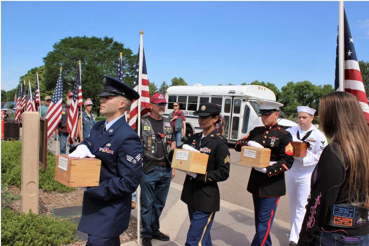
Final Procession to Ceremony