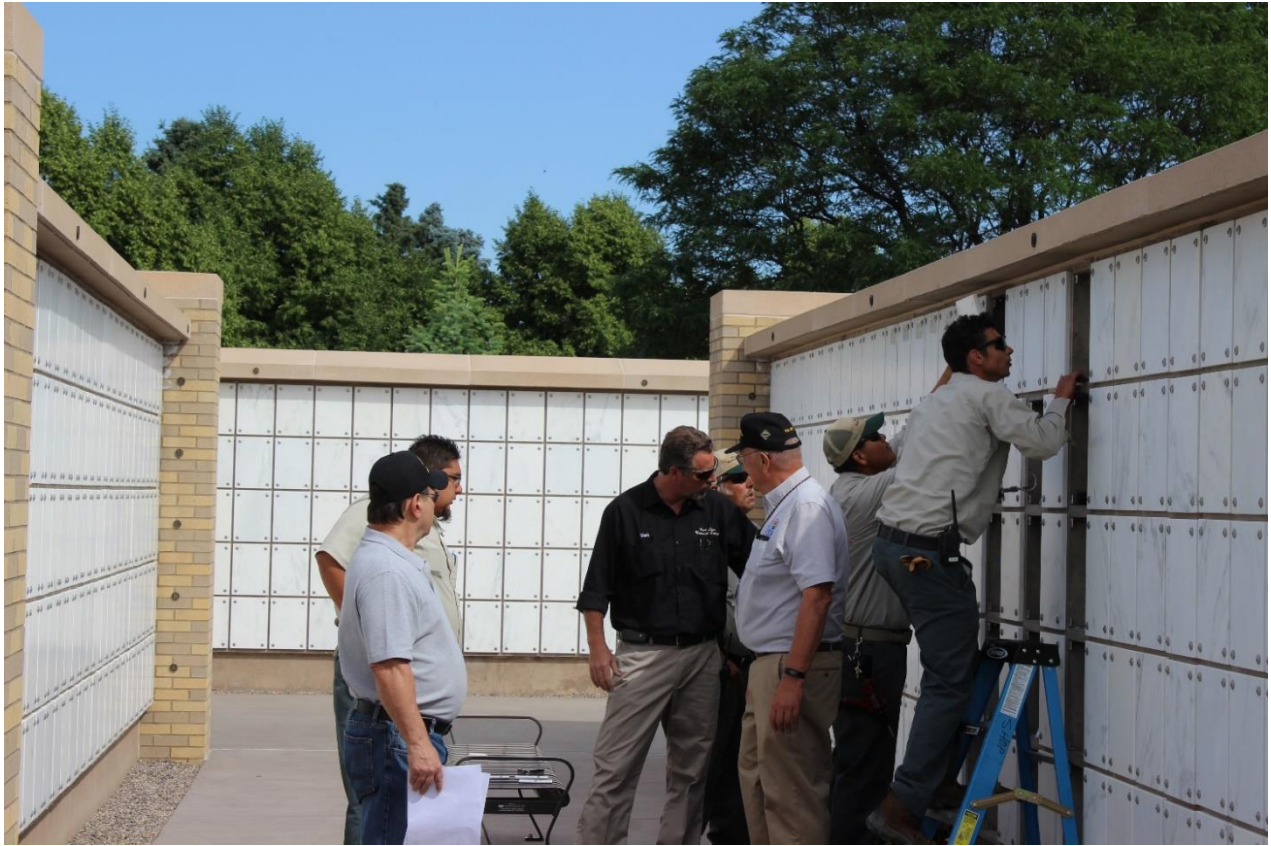
Opening the First Columbarium Niches