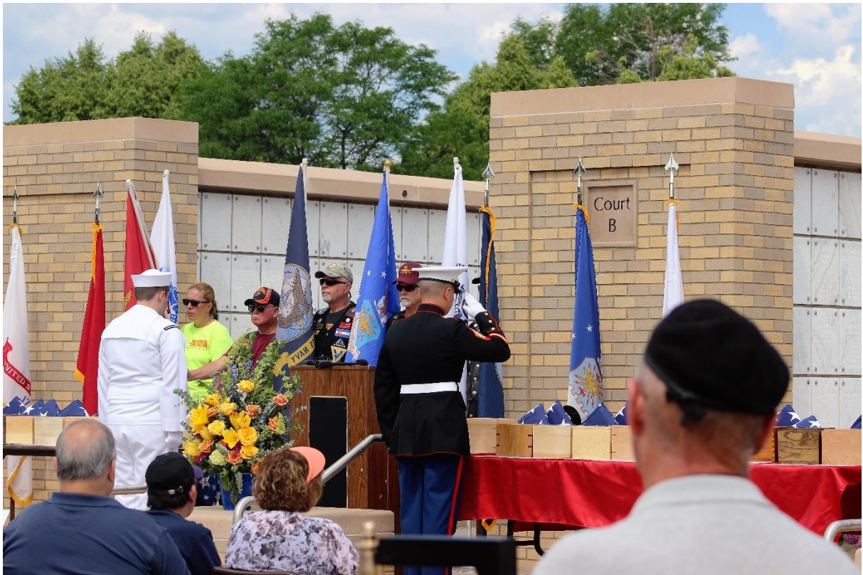
Patriot Guard Dips Army Flag As Branch is Called