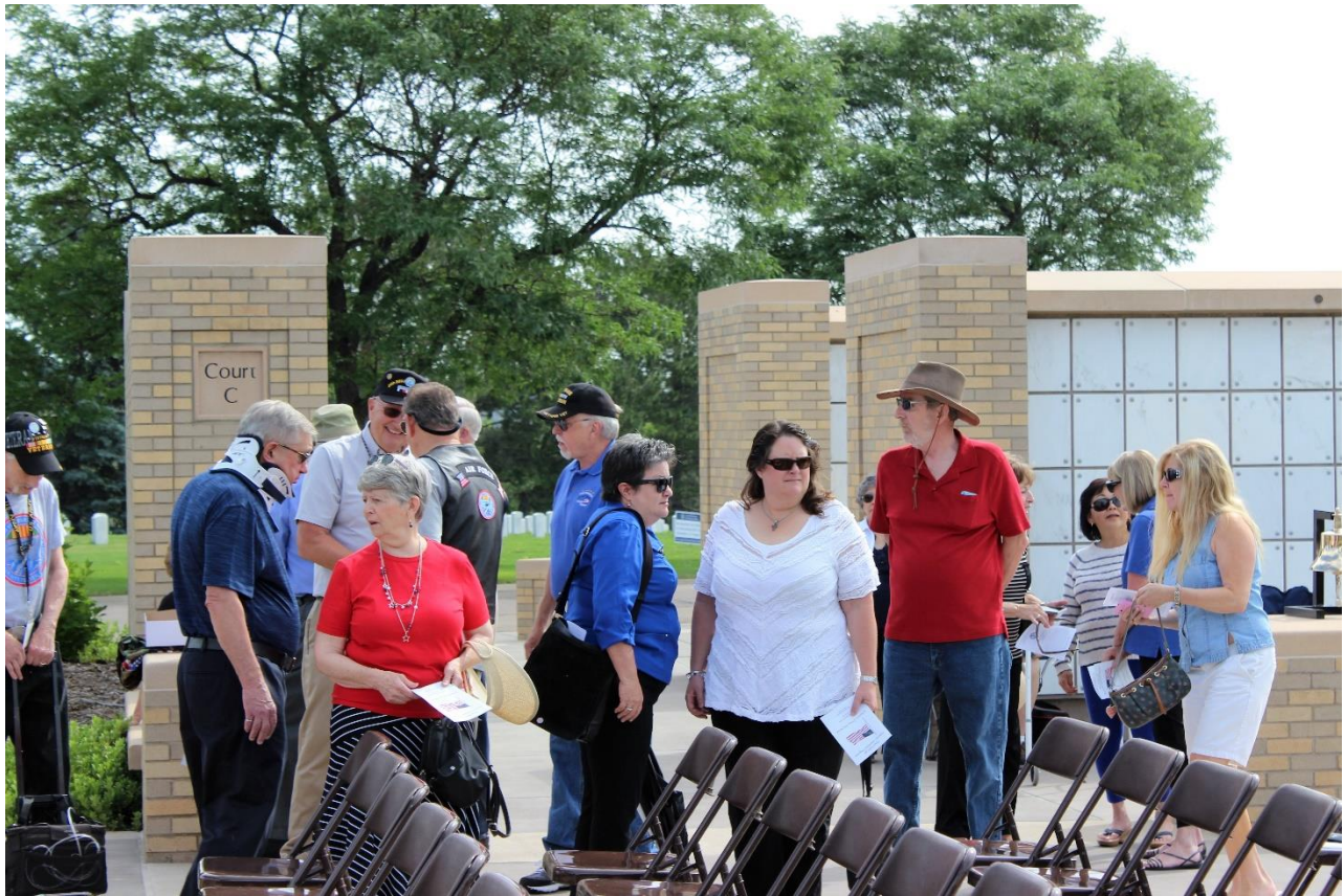
Folks Coming In