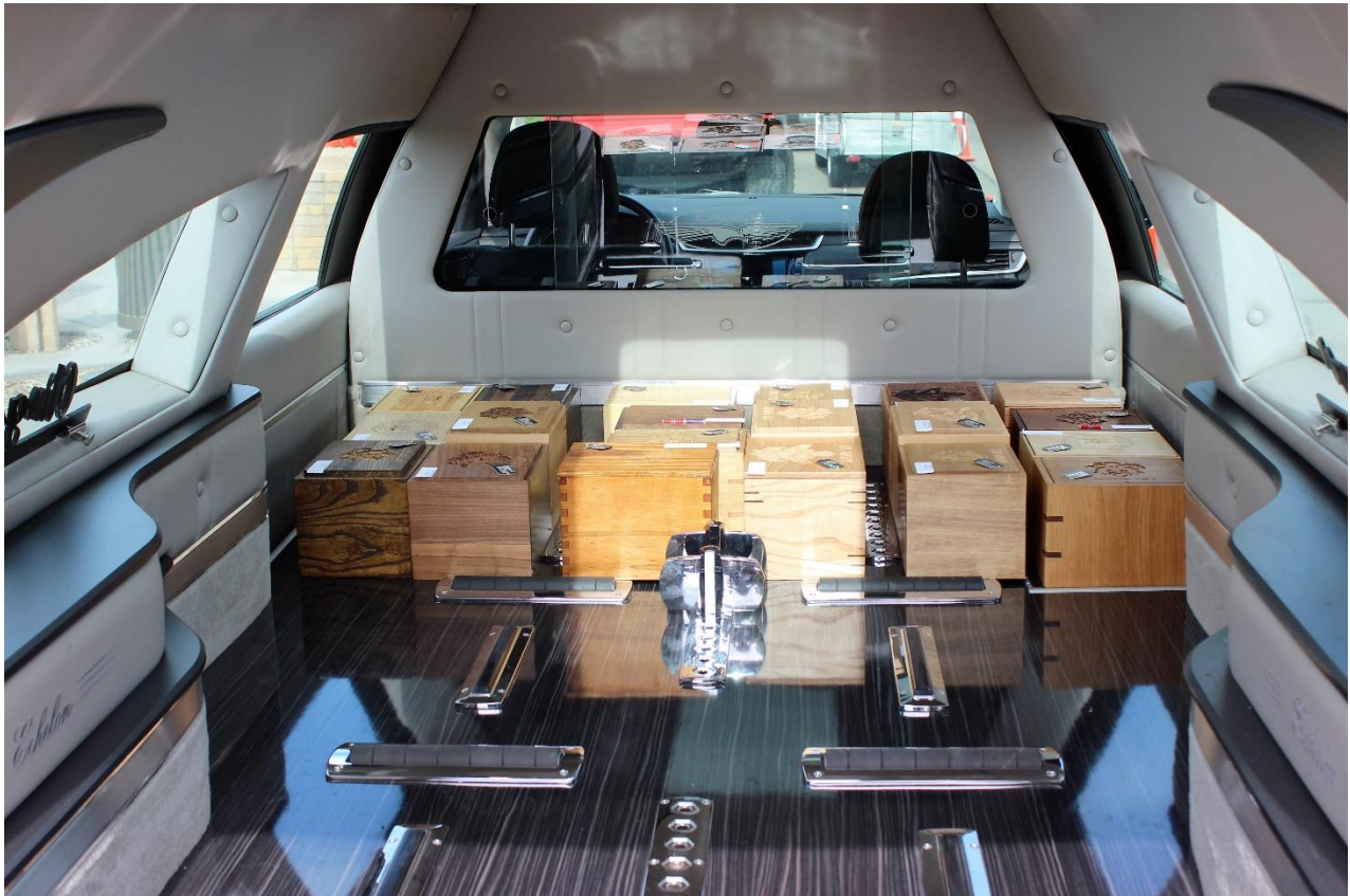
Urns Forward in Hearse