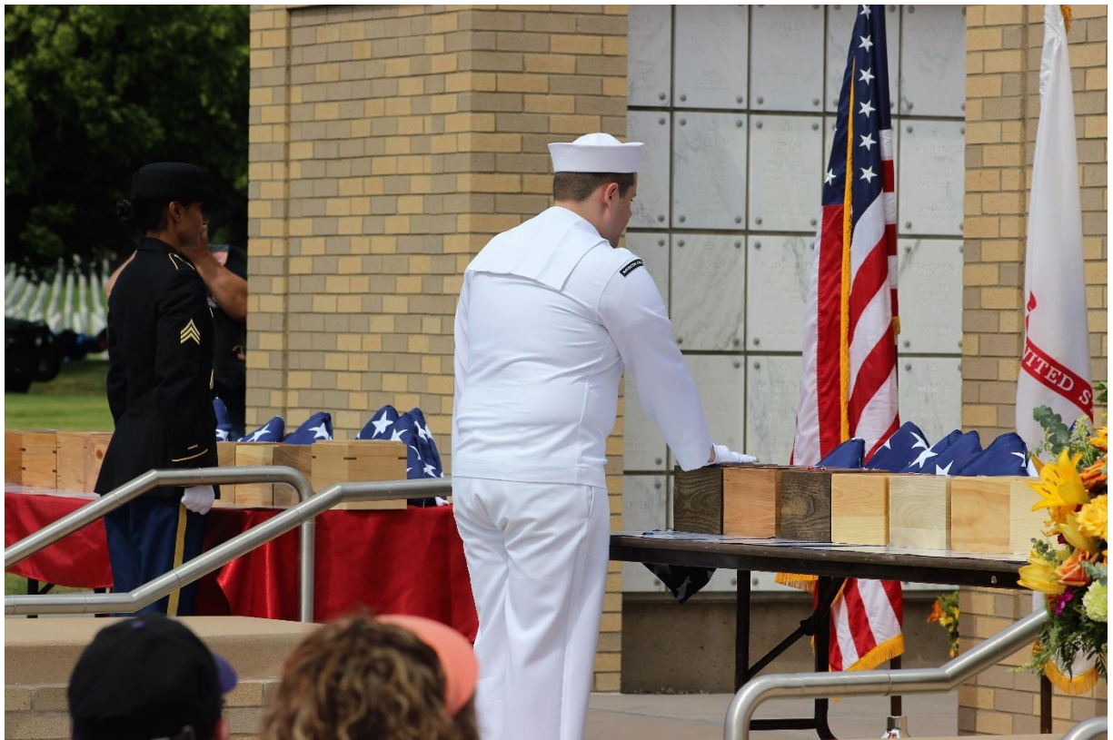
Color Guard Answers for Veteran, "Present"