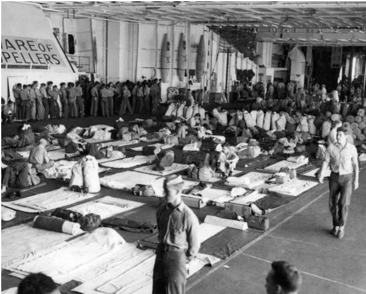
Hangar of the USS Wasp during the operation

There was enormous pressure on the operation to bring home as many men as possible by Christmas 1945.