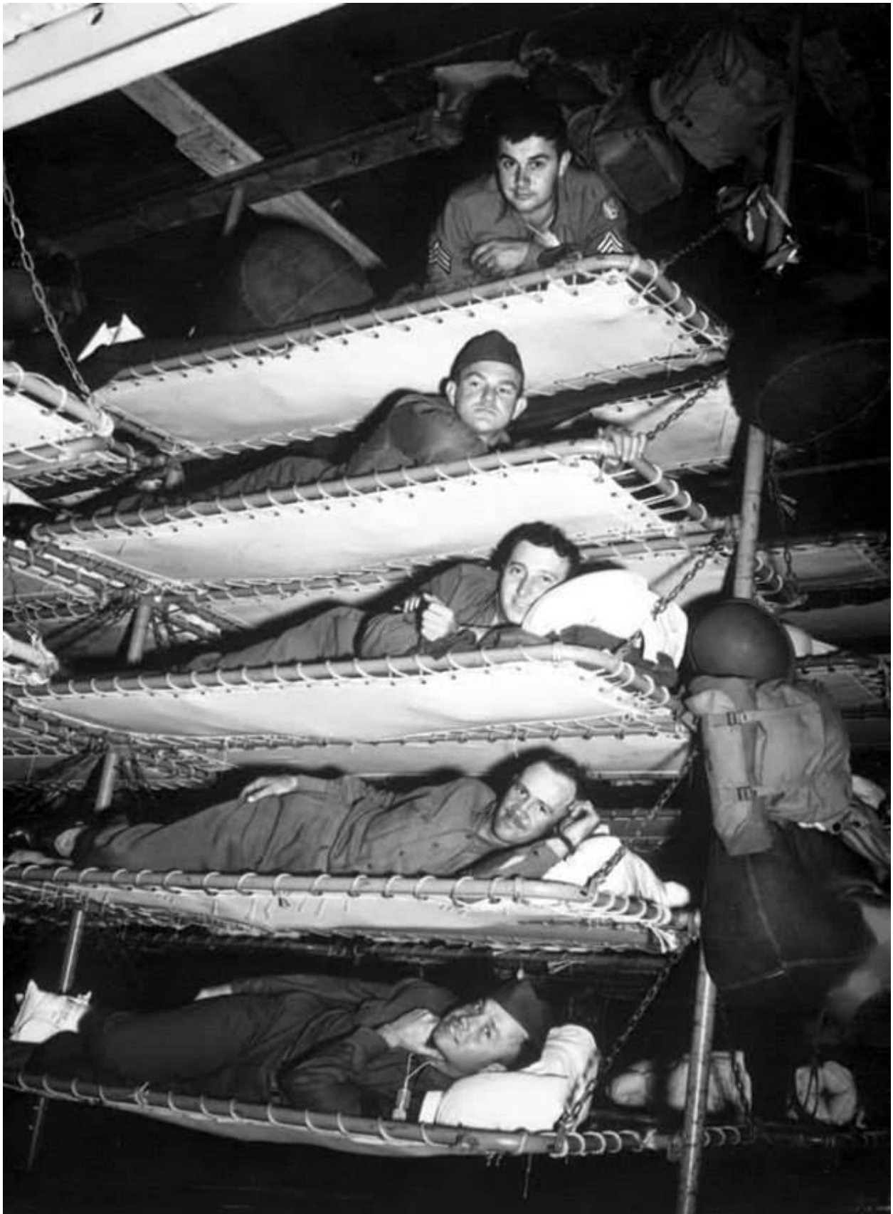
Bunks aboard the Army transport SS Pennant