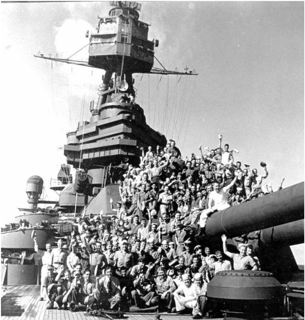
Overjoyed troops returning home on the battleship USS Texas

All in all, though, the Christmas deadline proved untenable. The last 29 troop transports, carrying some 200,000 men from the China-India-Burma theater, arrived in America on April 1946, bringing Operation Magic Carpet to an end, though an additional 127,000 soldiers still took until September to return home and finally lay down the burden of war.