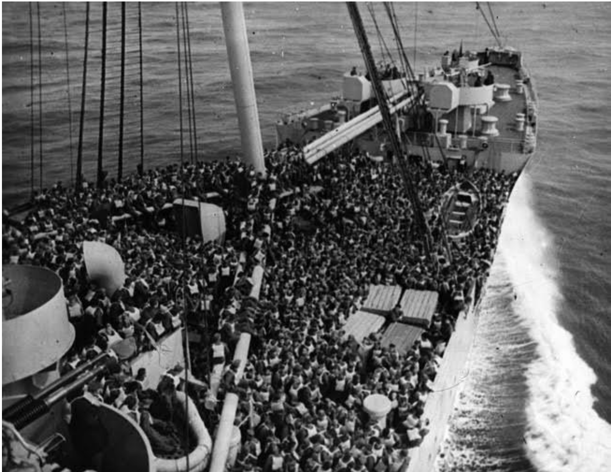
Troops performing a lifeboat drill onboard the Queen Mary in December 1944, before Operation Magic Carpet

Twenty-nine ships were dedicated to transporting war brides: women married to American soldiers during the war.